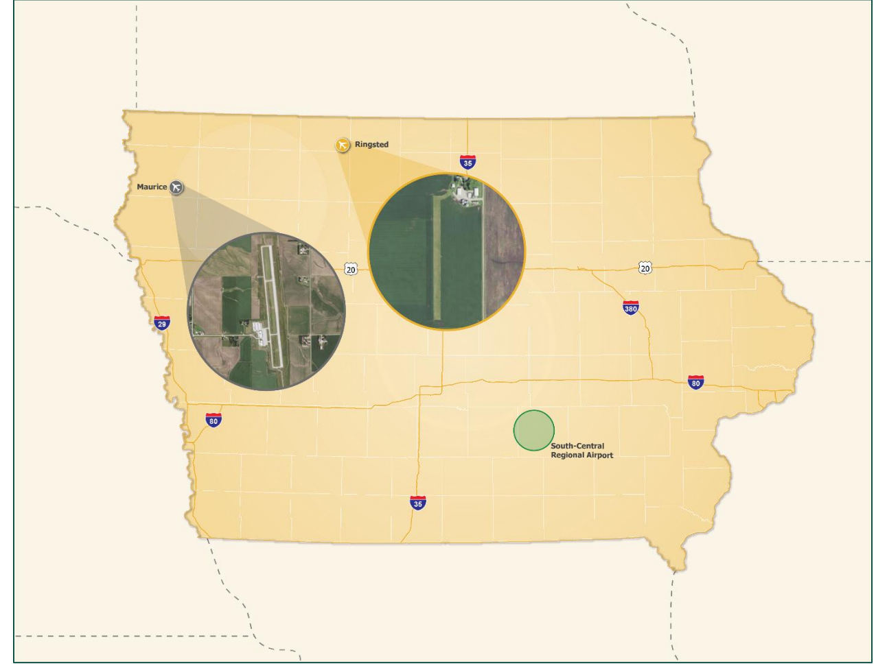
Figure 5-4: 2020 New System Airport Roles

The opening of the South-Central Regional Airport would result in the consolidation and closure of Pella Municipal Airport and Oskaloosa Municipal Airport, two General Service airports in the Iowa system. Figure 5-4 illustrates the location of the two new system airports as well as the general location of the planned South-Central Regional Airport.