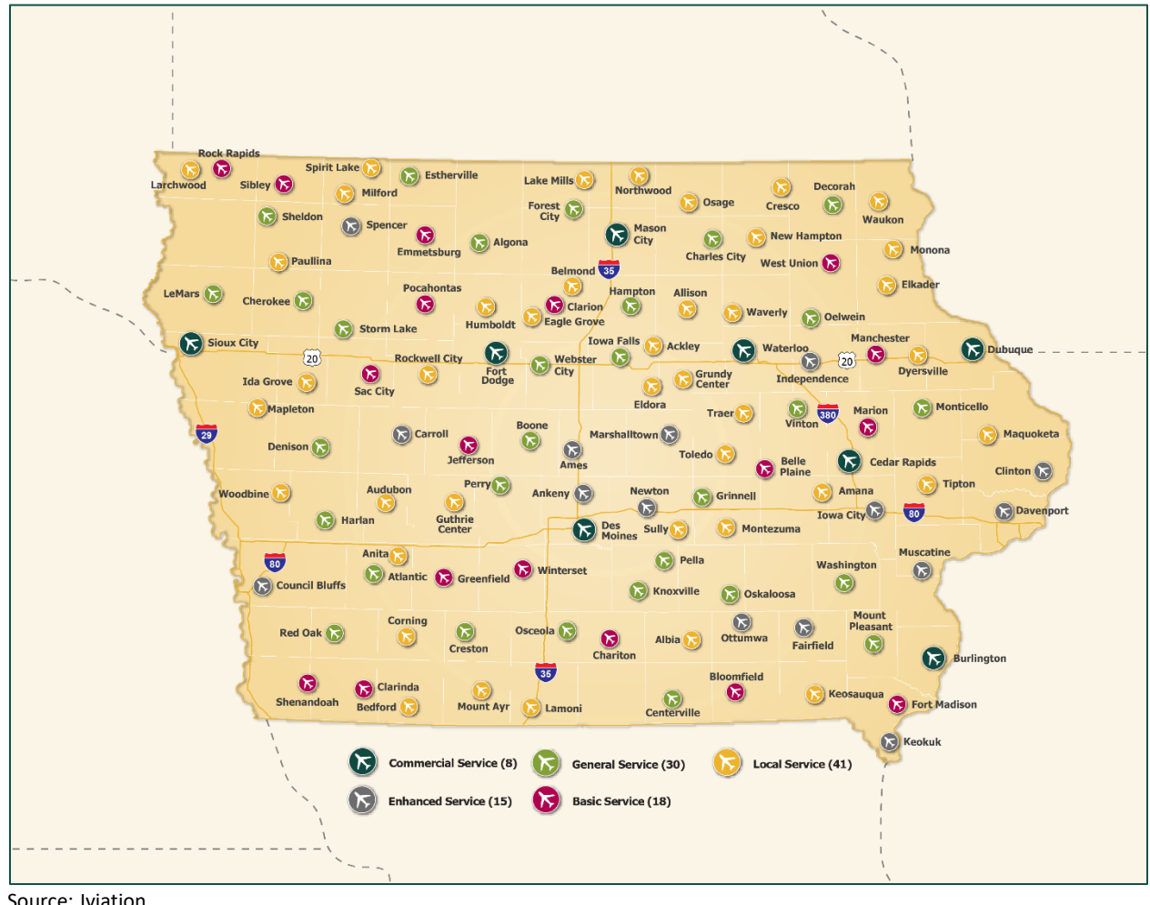
Figure 5-1: 2010 Iowa Airport System Roles

There were 117 airports included in the 2010 Iowa SASP. The current (2020) Iowa SASP contains 114 airports. Since the 2010 lowa SASP, the Sioux County Regional Airport was constructed and opened to the public in 2018. This airport is located in Maurice and offers a 5,500 by 100 feet runway. The facility is managed by the Sioux County Regional Airport Agency, which is the result of a partnership between the nearby cities of Sioux Center and Orange City, as well as Sioux County. The airports in Sioux Center and Orange City were closed as part of the planning and development process of the new Sioux County Regional Airport. Separately, three Local Service airports were closed in the last 10 years: Des Moines Morningstar, Onawa Municipal, and Primghar Airport. Aside from Sioux County Regional, Peltz Field in Ringsted is another airport to be included in the 2020 study. Both new airports will be evaluated and assigned roles in this chapter. With the closure of these five airports over the last ten years, there are 112 airports that were contained in the 2010 Iowa SASP that are open today. These airports and their 2010 SASP roles are summed below: