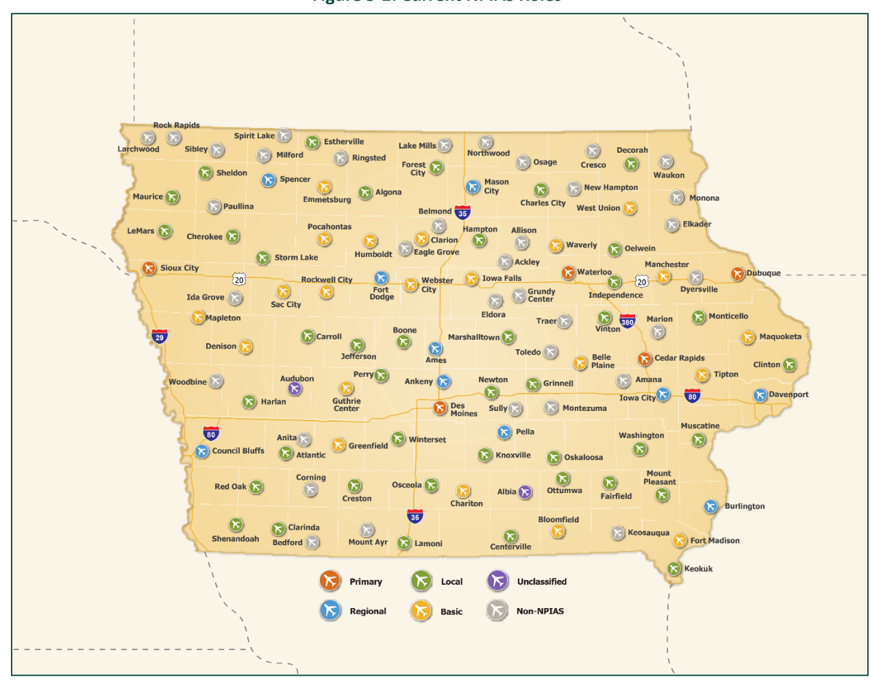
Figure 5-2 displays current NPIAS inclusion for Iowa's 114 system airports.